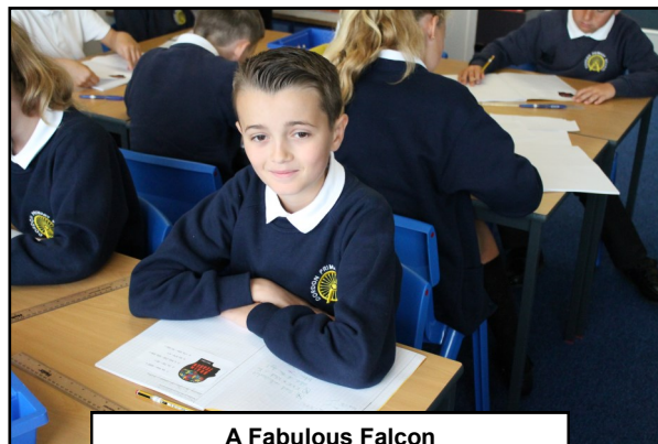
A Fabulous Falcon

All photographs can be purchased via ParentPay for £3 per A4 colour copy.