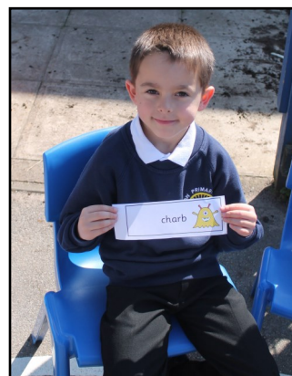
Outside Learning in Kingfisher class

All photographs can be purchased via ParentPay for £3 per A4 colour copy.