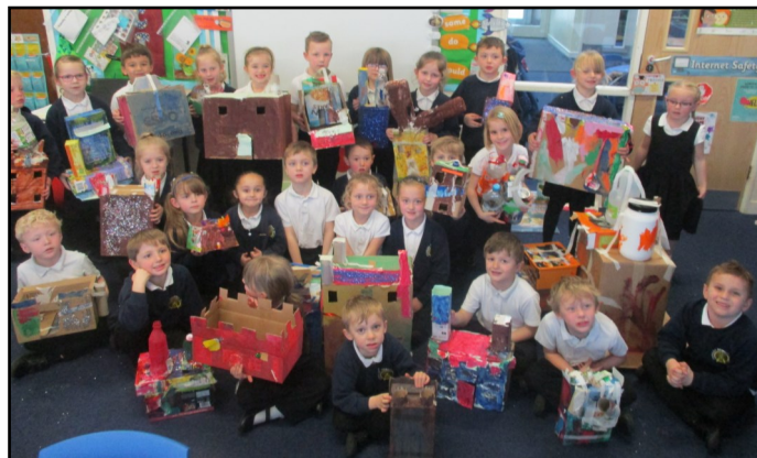
Kingfisher class and their magnificent models

All photographs can be purchased via ParentPay for £3 per A4 colour copy.