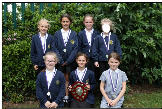
Y3/4 Girls Football team - Winners of the Warton Shield

All photographs can be purchased via ParentPay for £3 per A4 colour copy.