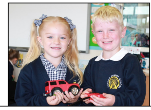
Two Kingfishers happy to be back at school

All photographs can be purchased for £3 per A4 colour copy. Please see the school office for one.