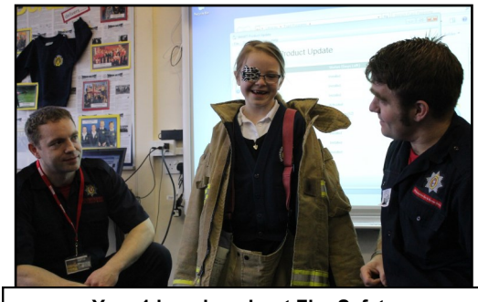
Year 1 learning about Fire Safety

All photographs can be purchased via ParentPay for \pounds 3 per A4 colour copy.