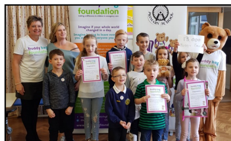
Packing Buddy Bags

All photographs can be purchased via ParentPay for £3 per A4 colour copy.