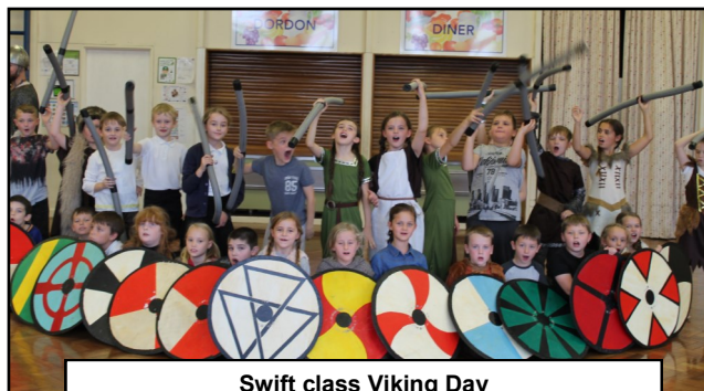
Swift class Viking Day

All photographs can be purchased via ParentPay for £3 per A4 colour copy.