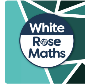
Y4 WRM - Autumn