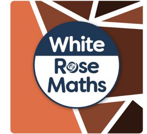
Y4 WRM - Summer