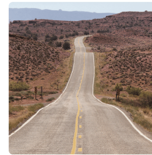
Road Trip USA!