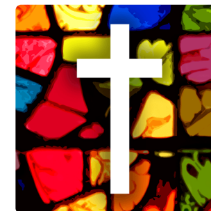
Holy Week and Easter