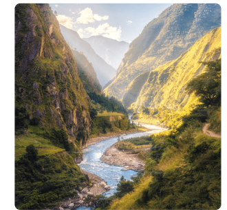
Misty Mountain, Winding River