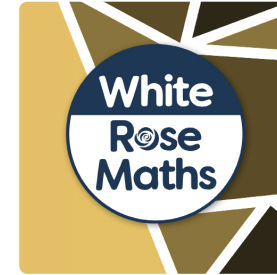
Y4 WRM - Spring