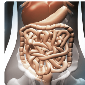
Burps, Bottoms and Bile