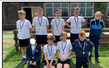
Y5/6 Kwik Cricket Team

All photographs can be purchased via ParentPay for £3 per A4 colour copy.