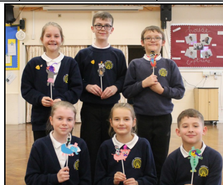
Y6 Puppet Making Workshop

All photographs can be purchased via ParentPay for £3 per A4 colour copy.