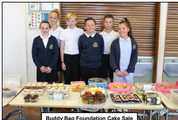
Buddy Bag Foundation Cake Sale

All photographs can be purchased via ParentPay for £3 per A4 colour copy.