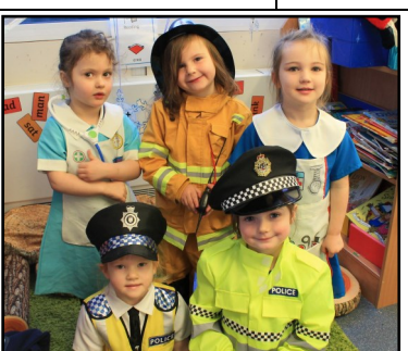
Young Carers Awareness Day

All photographs can be purchased via ParentPay for £3 per A4 colour copy.