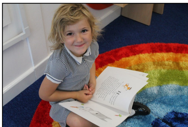
A happy Kingfisher

All photographs can be purchased via ParentPay for £3 per A4 colour copy.