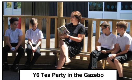
Y6 Tea Party in the Gazebo

All photographs can be purchased via ParentPay for £3 per A4 colour copy.