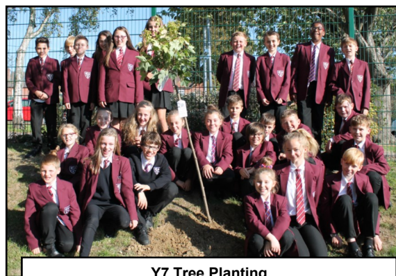
Y7 Tree Planting

All photographs can be purchased via ParentPay for £3 per A4 colour copy.