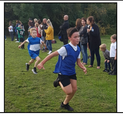
Water Orton Cross Country

All photographs can be purchased via ParentPay for £3 per A4 colour copy