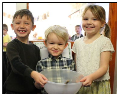
Working Hard on Enterprise Day

All photographs can be purchased for £3 per A4 colour copy. Please see the school office for one.