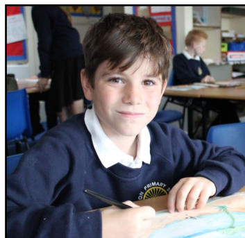
A hardworking Hawk

All photographs can be purchased via ParentPay for £3 per A4 colour copy.