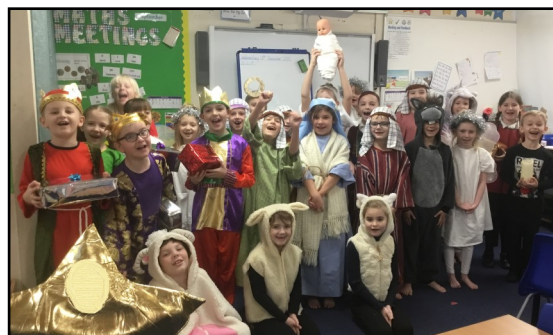
Owl class ready to perform in the Christmas Carol Concert

All photographs can be purchased via ParentPay for £3 per A4 colour copy.