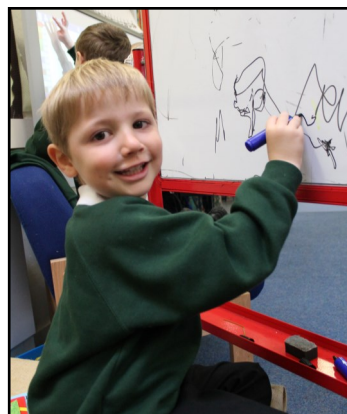
Learning through play in Peacock class

All photographs can be purchased for £3 per A4 colour copy. Please see the school office for one.