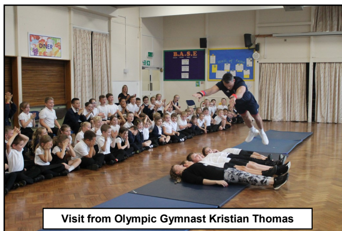
Visit from Olympic Gymnast Kristian Thomas

All photographs can be purchased via ParentPay for £3 per A4 colour copy.