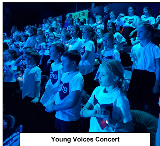
Young Voices Concert

All photographs can be purchased via ParentPay for £3 per A4 colour copy.