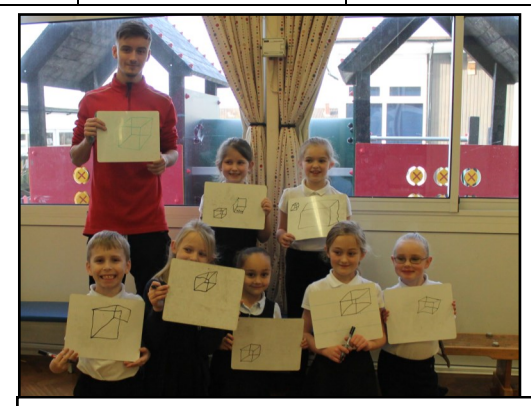
Y3 Enjoying Maths on the Move

had a restful Christmas and are looking forward to an exciting 2019.