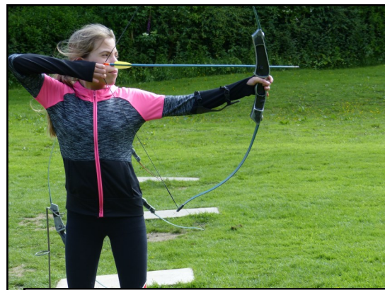
Learning new skills at Manor Adventure

All photographs can be purchased via ParentPay for £3 per A4 colour copy.