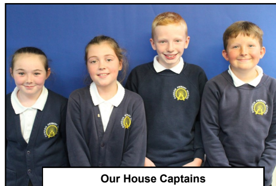
Our House Captains

All photographs can be purchased via ParentPay for £3 per A4 colour copy.