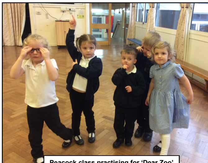
Peacock class practising for 'Dear Zoo'

Could you please ensure that your child brings their 'From Me To You' form and their 'Reading Pack' into school every morning. Also please remember to check your child's 'Me To You' form at the end of the school day