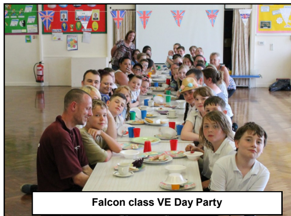
Falcon class VE Day Party

All photographs can be purchased via ParentPay for £3 per A4 colour copy.