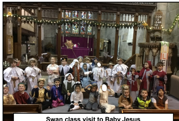
Swan class visit to Baby Jesus

All photographs can be purchased via ParentPay for £3 per A4 colour copy.