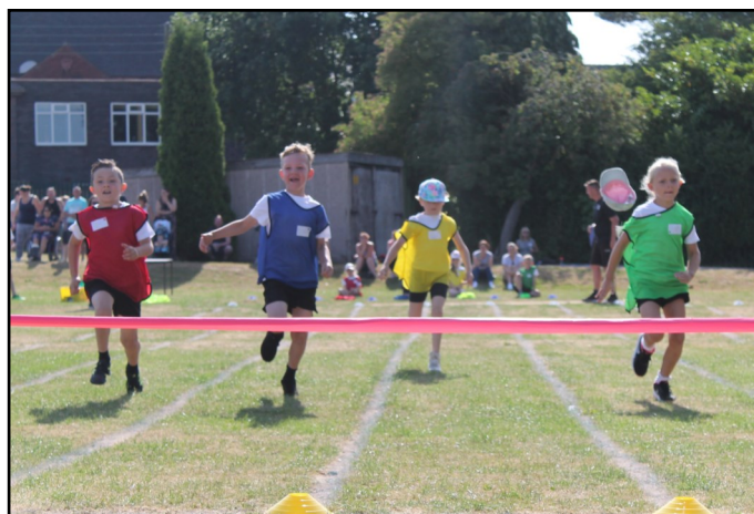
Racing for the finish line at Sports Day

All photographs can be purchased via ParentPay for £3 per A4 colour copy.