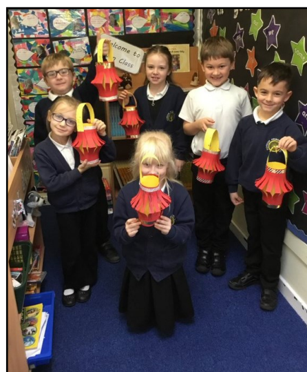
Celebrating Chinese New Year

All photographs can be purchased via ParentPay for £3 per A4 colour copy.