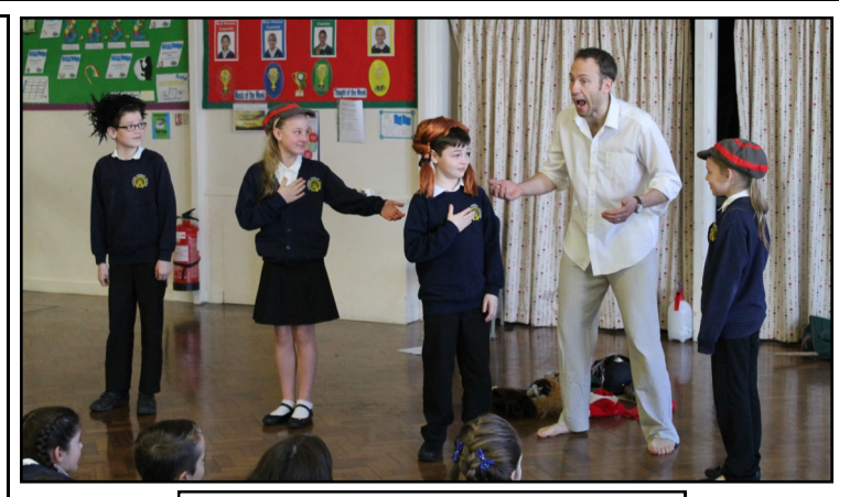
Enjoying Shakespeare with the Storyteller

Our vision is to provide children with Rich Opportunities, Memorable Experiences